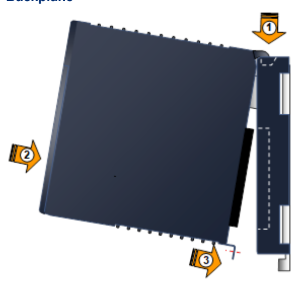
Figure 2: Installing the PNS Module into a Backplane